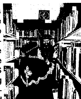
Pope Shenouda III and Bishop Suriel in the Library

Affiliated Regions and Dean of the College. Bishop Suriel was instrumental in the purchase of the Library's ILMS system, in ensuring the Library collection's continued expansion and in recognising the importance of a first class Library to support the College.