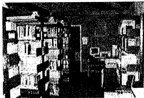
The St John of the Cross Priory Library, Discalced Carmelites, Box Hill, Vic.

Studying theology is a great asset to my work, as well as being spiritually satisfying. I consider myself very fortunate working in 'my' libraries, providing a professional library service to the residential communities of different religious orders associated with Yarra Theological Union.