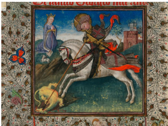
St George and the Dragon (and Virginity).