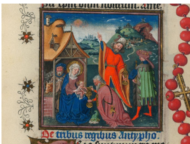
The adoration of the magi.

During a voyage to the Holy Lands, a fierce storm blew up, threatening the ship. He prayed over it, and the storm calmed. Hence he is the patron of those who travel by sea. Feast December 6.