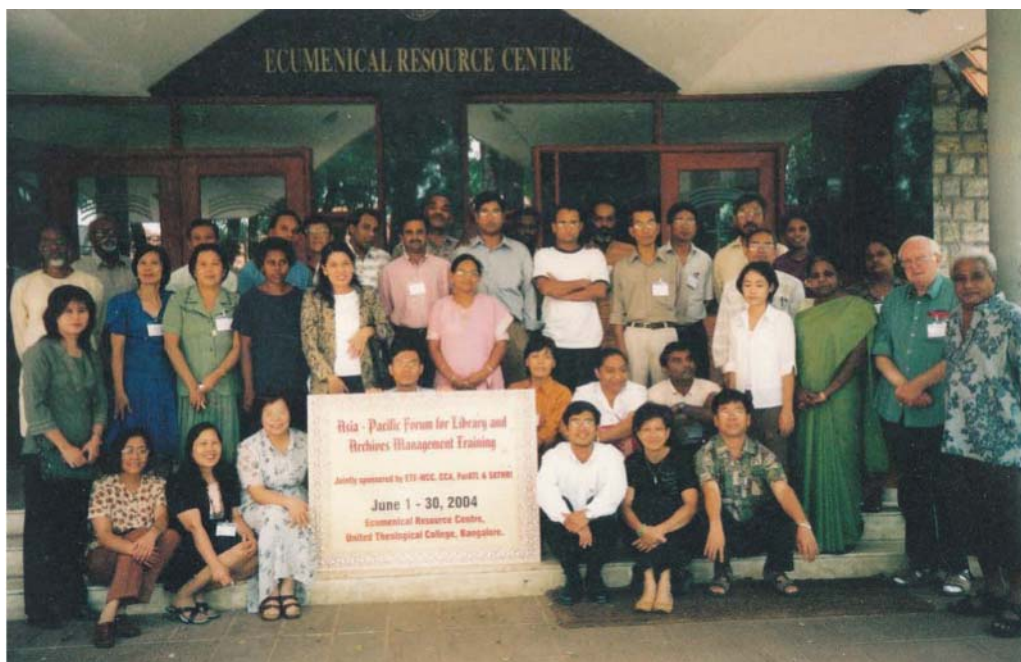
Bangalore Archive Course, 2004

It was through her influence that we Pacific librarians could continue to attend conferences (as above) that enhance our skills and knowledge as librarians.