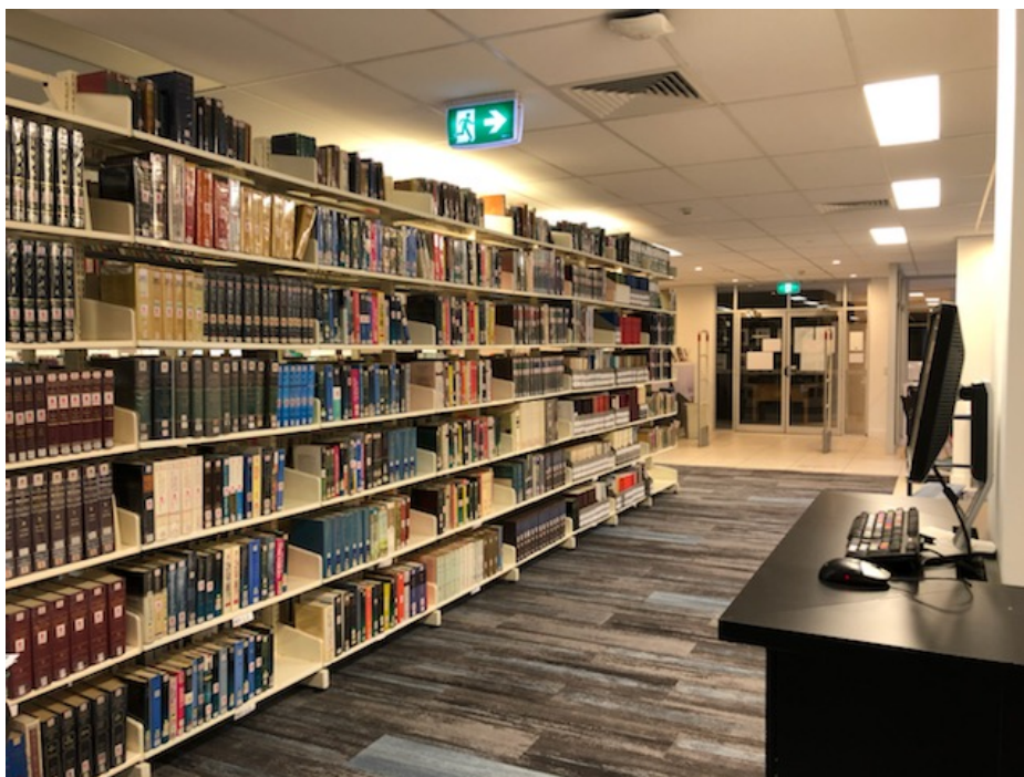
Sydney Campus Library