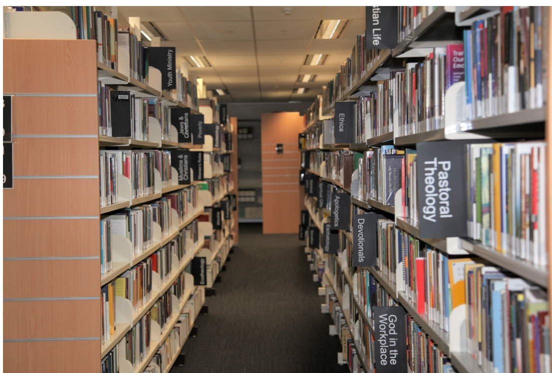
Melbourne Campus Library