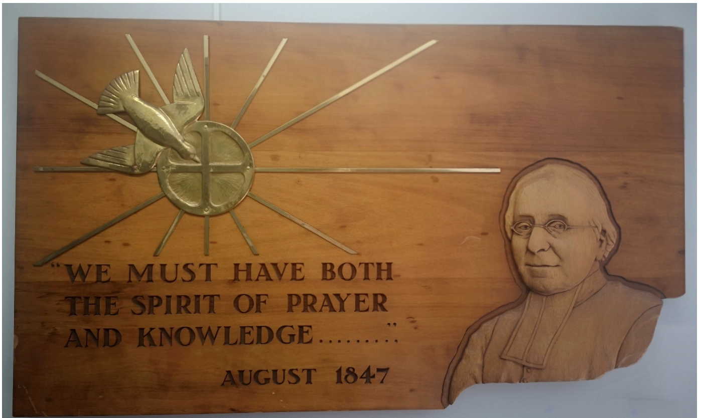
Plaque above library entrance.