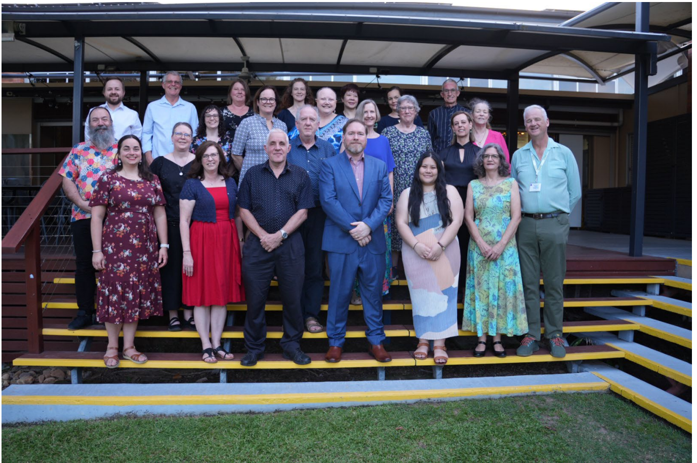
Figure 1: Conference attendees on the steps of the Women’s College, University of Queensland

The 39th ANZTLA Annual Conference, “ Echoes of the Past ... Creating Stories for the Future ”, was held at the Women’s College, University of Queensland from 26-29 November 2025. The Queensland Chapter is to be commended for organising such an informative, inspiring and welcoming conference.