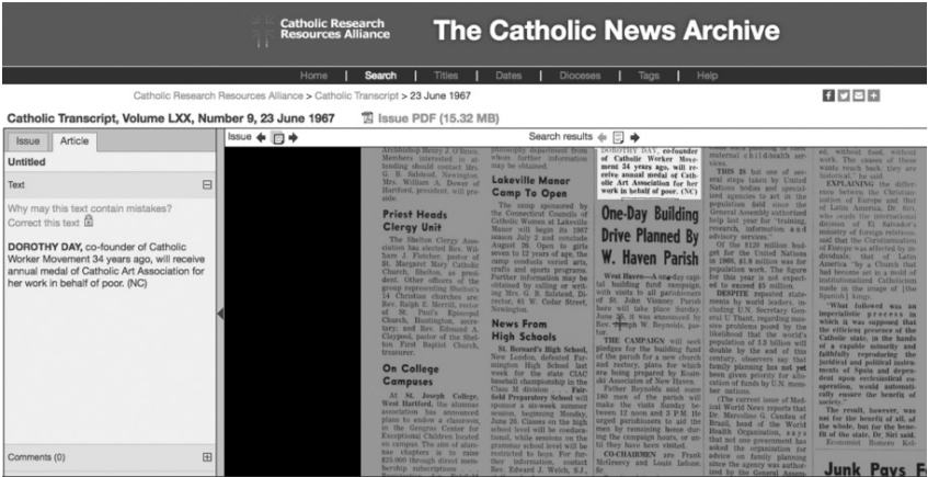
FIGURE 1 Article on “Dorothy Day” from the Catholic Transcript in the Catholic News Archive

the results. The Archive includes a text correction module, which allows collaborative correction of the digitized text from which search terms are identified, thus making for more effective and complete results.