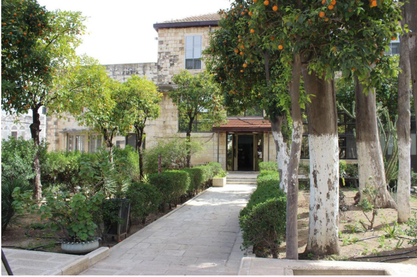
FIGURE 3: The Nablus Municipality Library.

In Palestine, the public libraries function as centers for political resistance to the occupation.