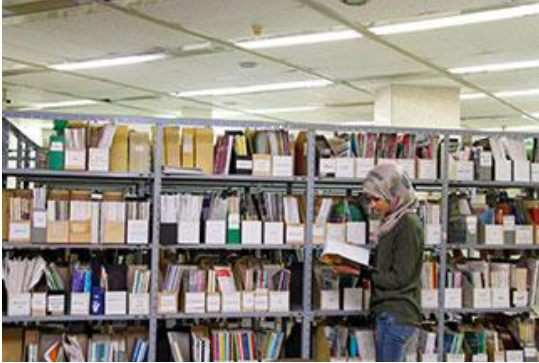
FIGURE 6: A student in the stacks at Birzeit University Library ( https://www.birzeit.edu/en/bzu-library ).

does not end with physical assaults on campuses, students, faculty, and staff at Palestinian universities. The universities are structurally undermined as the crippled economies of the West Bank and Gaza cannot produce the tuition fees necessary to fund university budgets.