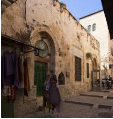
FIGURE 8: Khalidi Family Library (Wikipedia).

rare manuscripts that are considered originals, with 112 manuscripts written in the handwriting of the author. While the Khalidi Library is open to the public, the demographic that it serves most frequently is researchers.