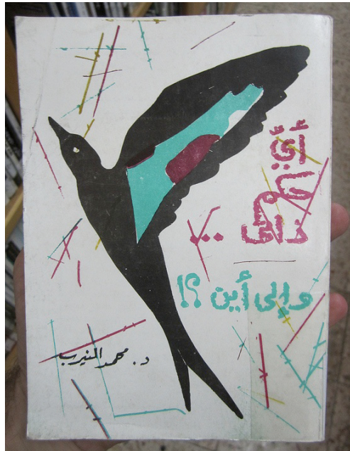
FIGURE 4: A photo of a book cover in the collection at Al-Bireh Public Library.