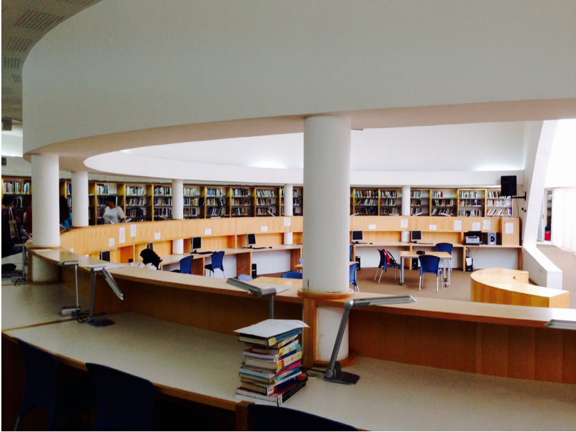
FIGURE 2: Abu Salma Public Library (Librarians with Palestine, librarianswithpalestine.org/featured-projects-members/public-libraries/abu-salma-public-library/ ).

from the city, as well as the surrounding villages. The library collection here is mostly academic titles with some fiction and non-fiction works in Arabic, English, and Hebrew. As in other areas inside Israel proper, the West Bank, and Gaza, library funds are usually the first thing to get cut from budgets. Funding for building maintenance comes from the municipality in the form of taxes, yet the funding for books, computers, and programs comes from the Israeli government. Government funding is based on the amount of library staff on location. In Nazareth there are currently four positions, filled by six staff members, who are doing the work of eleven (Librarians for Palestine). This artificially low headcount results in low funding. Books are expensive and, due to the lack of funds, maintaining an updated collection is nearly impossible. Instead of being given cash for acquisition purchases, the librarians are given credits that can only be used at certain government-approved vendors. However, in order to navigate around this official system and be able to purchase from other vendors, there is an unofficial system that is utilized. There is a chain of people that works to get these titles, however, by the