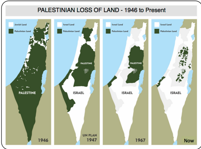
FIGURE 1: Image of shrinking Palestinian territory.

tion for both anti-Semitism and Jewish secular culture. “It is impossible to discuss the realities of the West Bank situation and what this means for Palestinians without reference to Israel’s political ideology of Zionism . . . the objective of Zionism from the beginning has been to take control for the Jewish people, as much of the land of Palestine with as few non-Jewish natives there as possible” (Christison 2008, 33). Political Zionism is the ideology at the center of the dehumanization of the Palestinian people.