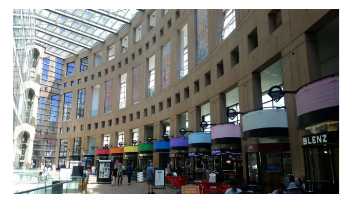
Inside main entrance of VPL.