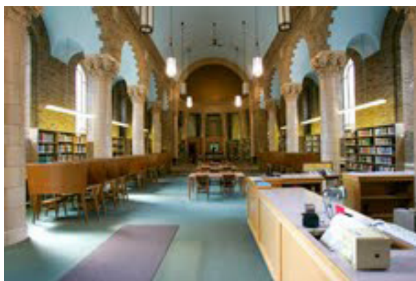
Second floor before renovation

M urphy Memorial Library undertook a modest renovation project during the 2007-2008 school year. The library serves Baptist Bible College and Seminary in Clarks Summit, Pennsylvania. The library occupies part of the lower two floors in the main academic building. The first-floor library holds most of the library's volumes, staff space, and circulation counter. The second floor contains the reference collection, quiet study space, and periodicals. Space in the library was originally configured for individual study. While some tables for group work were present, the library's space on the second floor was dominated by thirty-six study carrels.