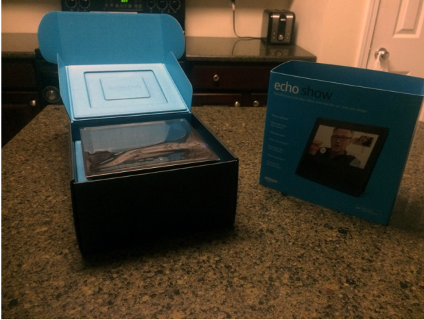
Figure 1: Echo Unboxing

To get ready for the clash of the reference titans, I discovered a few third-party skills in the Amazon library that seemed relevant for the field of religion. (Although, it was tempting to download the skill that might be used to tune a guitar or the game that enables one to play rock/paper/scissors — I’m not joking; that really exists). To be honest, most of the available religion skills that have been developed to this point are devotional in nature, such as those that feature an inspirational quote of the day. One example is the skill that reads Pope Francis’s most recent tweets. There are more than a handful that focus on Bible trivia or facts. Only a precious few skills are informational or are capable of plumbing datasets for content. To complicate things, since skills developed by third-party programmers are not native to Alexa, accessing many of these skills on Alexa also require knowledge of specific names and commands. In order to hear the pope’s