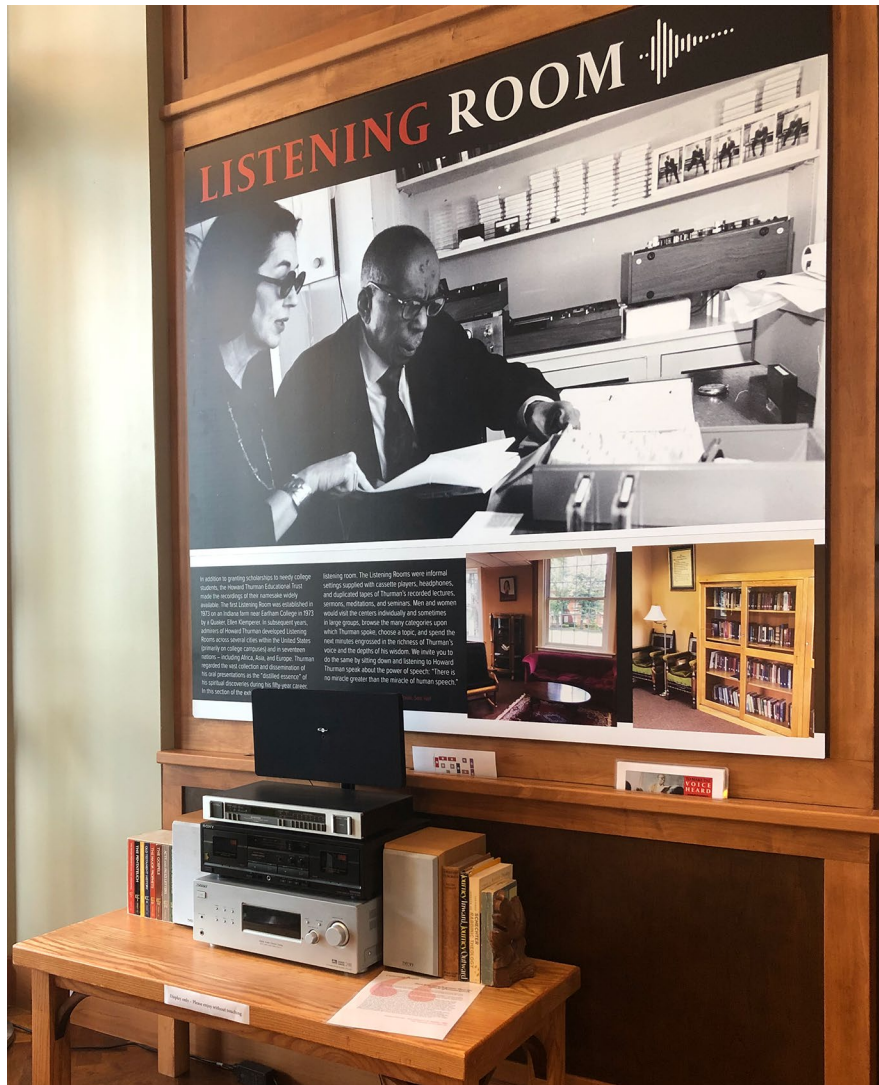
Image 2: The Howard Thurman Listening Room Experience at Pitts Theology Library

Our version of a listening room invited visitors to begin with a moment of quiet listening and reflection in a comfortable space, preparing for the rest of the exhibition in which the Thurmans' voices were prominently featured. It was important for us to begin the exhibition this way because Thurman himself acknowledged, "my craft remains the spoken word" (Thurman 1979).